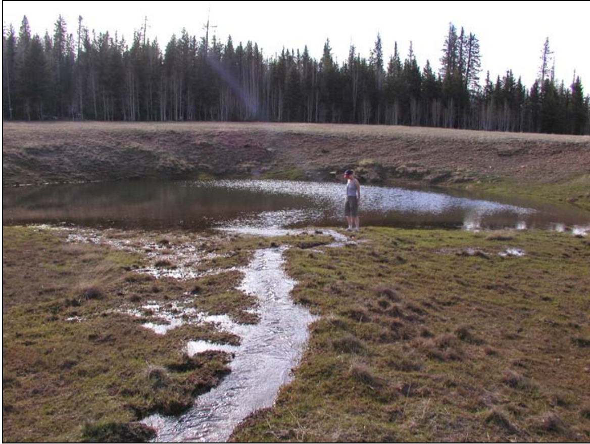
Figure 2. Recharge through sinkhole near the North Rim entrance gate on the Kaibab Plateau.