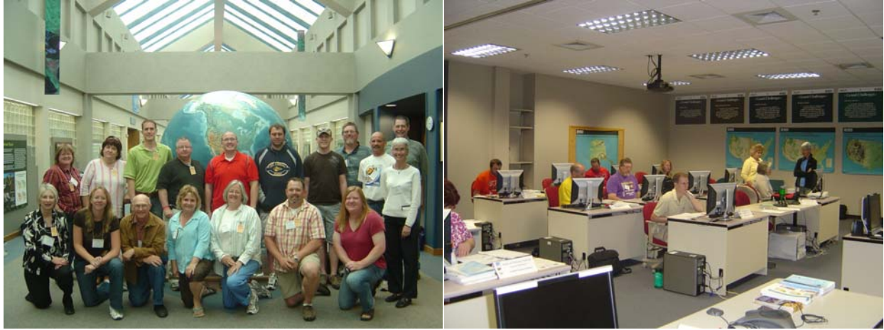
Figure 2. Teachers and AmericaView instructors at the 2009 Geospatial Technology for Educators workshop at the USGS Center for EROS