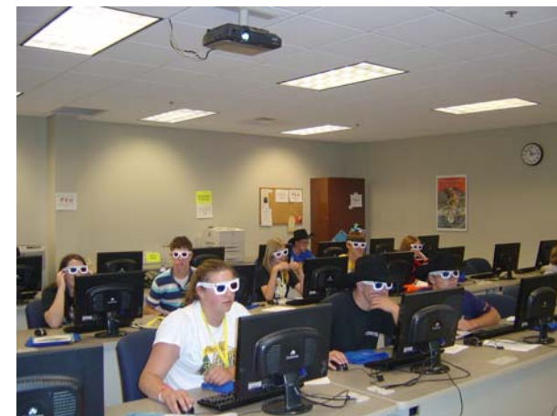
Figure 3. Students of all ages learning about GPS and remote sensing