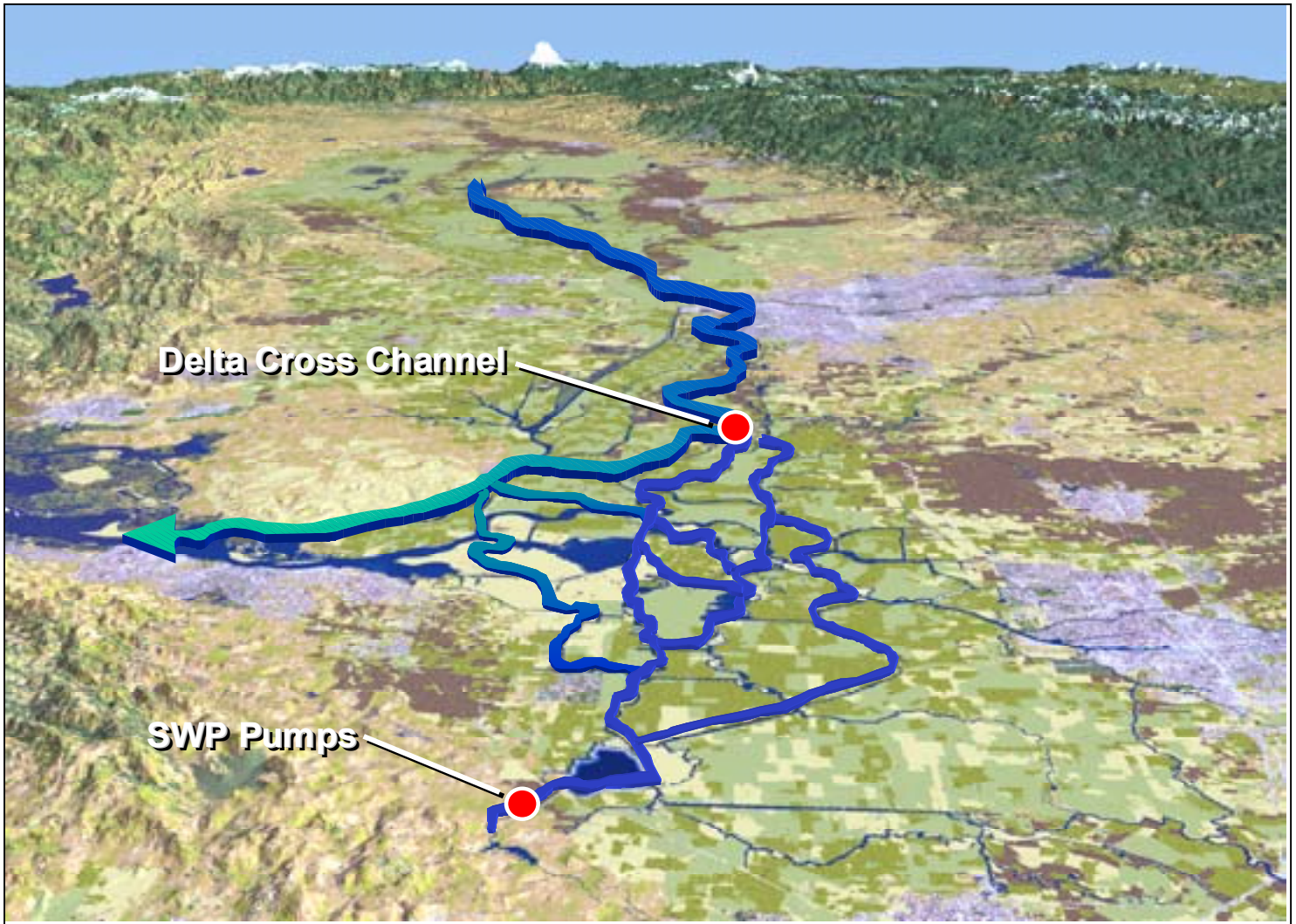
Figure 1. Through Delta Conveyance Concept