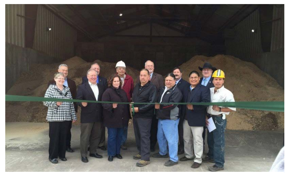
Ribbon cutting for Menominee Tribal Enterprises' biomass facility.

Another major barrier to increasing the scale of active forest management is a lack of markets for excess. lowvalue hazardous fuels that must be removed from overgrown federal forests. Biomass and biochar technologies offer two innovative utilizations for this excess material that could help ramp up forest management