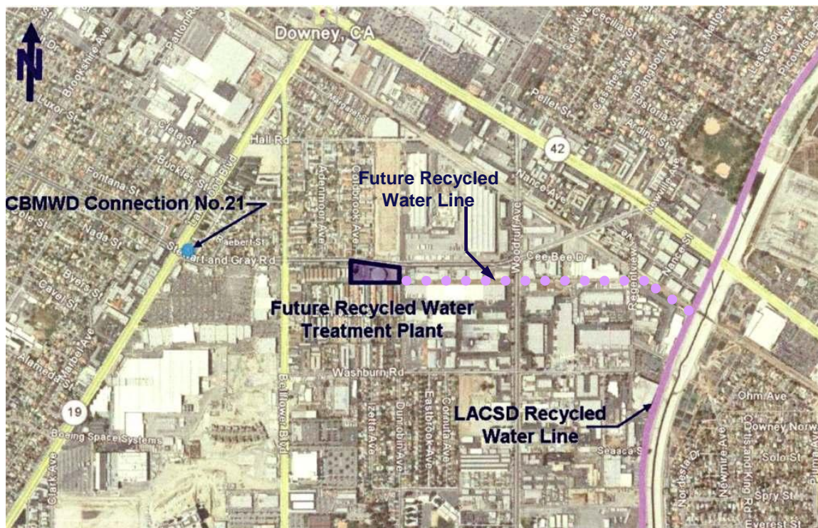
Figure 1. Project Area Map