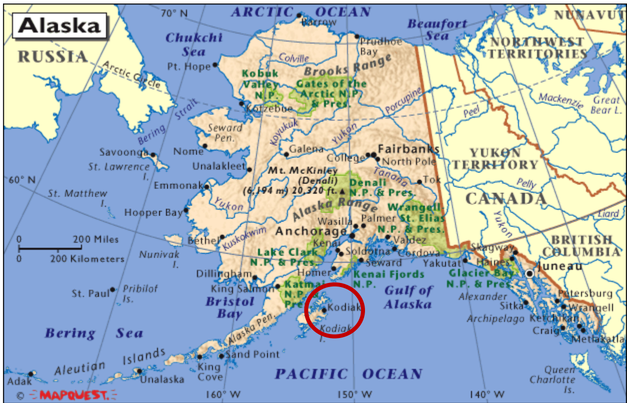
Figure 1. Location of Kodiak, Alaska.