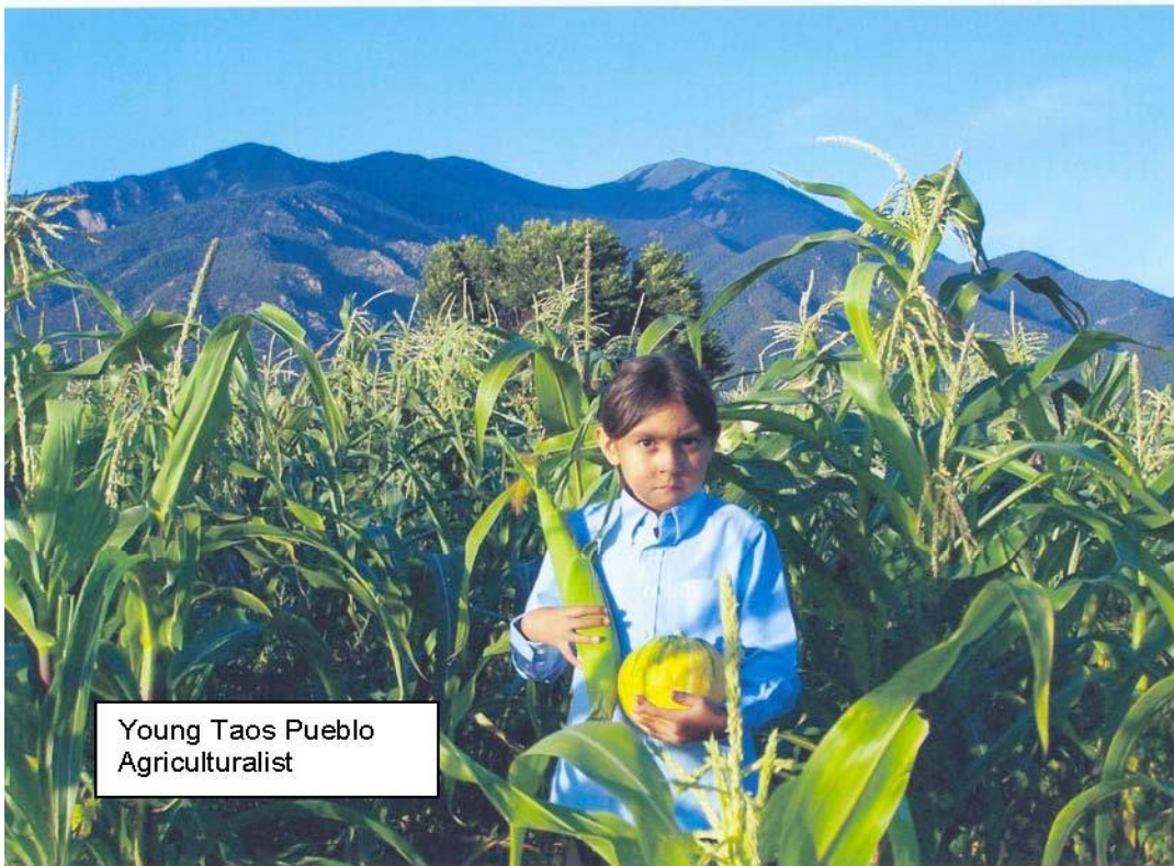
Young Taos Pueblo Agriculturalist