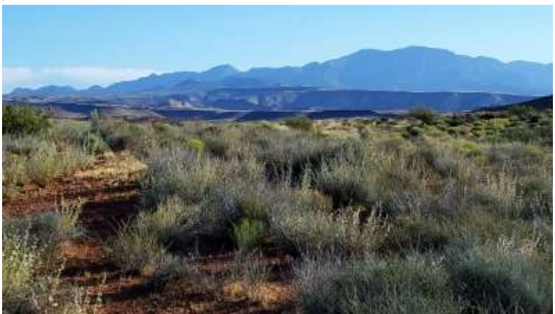
The Red Cliffs Desert Reserve/National Conservation Area the proposed Northern Corridor Highway would be built, through the prim

The public lands in Washington County contribute to our quality of life, providing areas for world class outdoor recreation, protecting water quality and clean air as well as providing wildlife habitat. CSU works to ensure the irreplaceable cultural, scenic, ecological and scientific values are protected and properly conserved. We hope that county, state and national leaders will work with us, too.