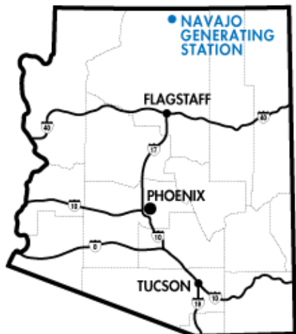
Figure 1: Navajo Generation Station Proximity

NGS is near the town of Page, Arizona, (Figure 1) and located on the Navajo Nation's Reservation. Construction of NGS began in 1969 as part of the Colorado River Basin Project Act. The plant, which became operational in 1976, provides the power necessary to move Arizona's allocation of Colorado River water to central and southern Arizona. There are multiple participants that hold an interest in NGS: Salt River Project (42.9%), Arizona Public Service Co. (14.0%); Nevada Energy (11.3%); Tucson Electric Power (7.5%), and the Bureau of Reclamation (24.3%). 15