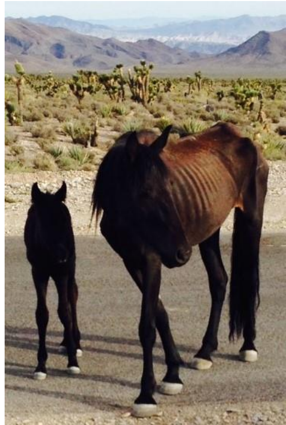
Starving mare and foal gathered in Nevada 2016 No livestock in area