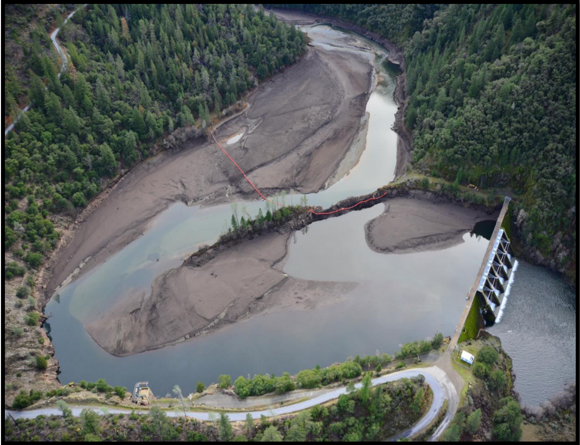
(Placer County Municipal Water Supply Oxbow Reservoir, Rubicon River Watershed; Spring 2015)

There are also substantial impacts to wildlife habitat from 15 years of large wildfires. Wildfire has burned at least 100 California Spotted Owl Protected Activity Centers.