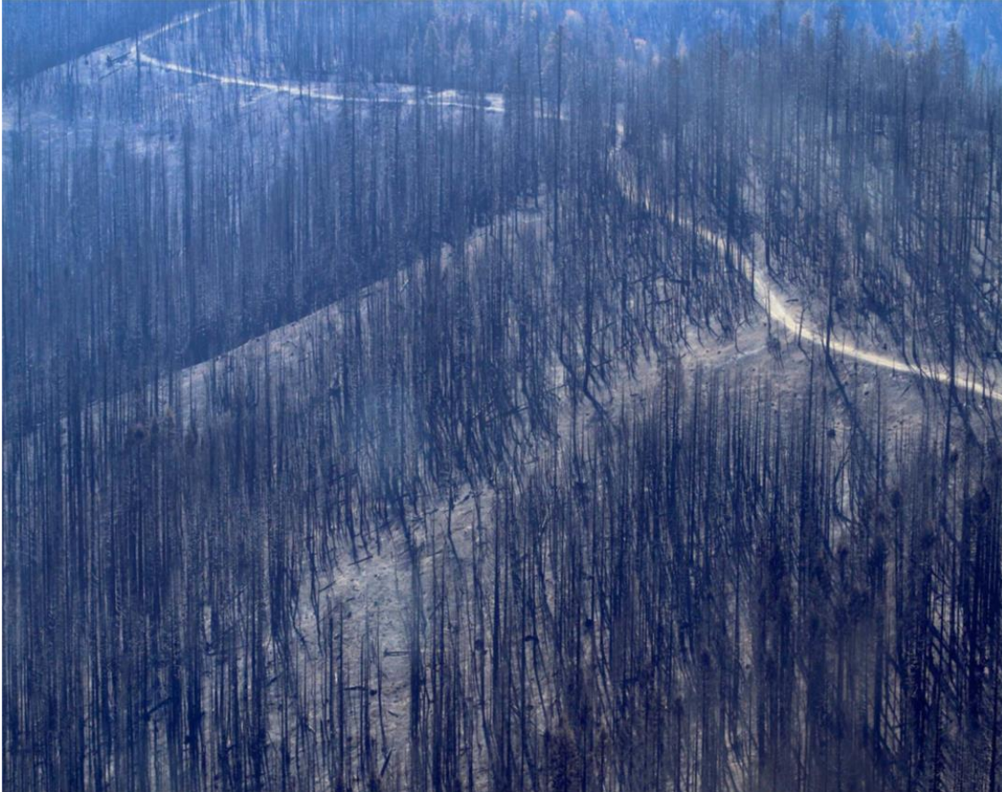
(King Fire, Eldorado National Forest, High-Severity Burned Area, Rubicon Watershed)

than 90 percent of the vegetation killed). In 2013, the portion of the Rim Fire on the Stanislaus National Forest had high-severity on 38 percent of the burned acres. And in 2014, the 97,000 acre King Fire on the Eldorado National Forest was 47% high severity.