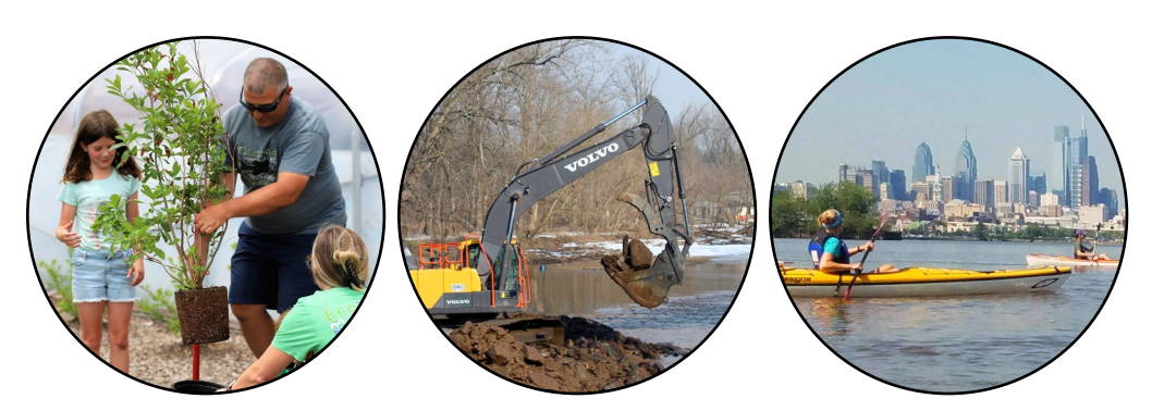
Left to right: Volunteers installed native plants to serve as pollinator habitat ; Large machinery was used to remove the Lenape Dam along the Brandywine River ; Kayaker enjoying views of Philadelphia.

importance of and demand for the DRBRP to the U.S. Fish and Wildlife Service and its partners, as well as the value it holds for the Delaware River watershed.