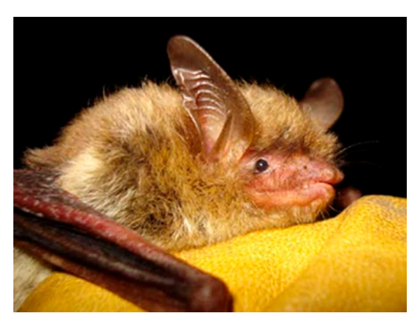
Figure 2 Northern Long-Eared Bat

The ESA mandates that all Section 9 prohibitions apply to endangered species. However, Section 4(d) of the ESA allows the Services to grant some exceptions to the prohibitions in Section 9 for threatened species. Decifically, the law charges the agencies with promulgating regulations as the Secretary deems necessary and advisable to provide for the conservation of such species. This gives the Services greater flexibility when drafting regulations aimed at conserving a species, ensuring that they are protected while allowing for economic development, recreational activity, and energy production when such activities pose little threat to the species.