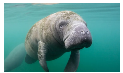
Figure 1: Manatee.

The USPS often sells stamps to pay tribute to important holidays and events, to recognize the legacy of leaders throughout the United States' history, and of other individuals and activities important to the American way of life. H.R. 3119 would build on that tradition by authorizing the USPS to offer a "Manatee Semipostal Stamp" to pay tribute to the manatee. Under this legislation, the funds generated through sales of this stamp would be transferred to USFWS to protect the manatees and their habitat.