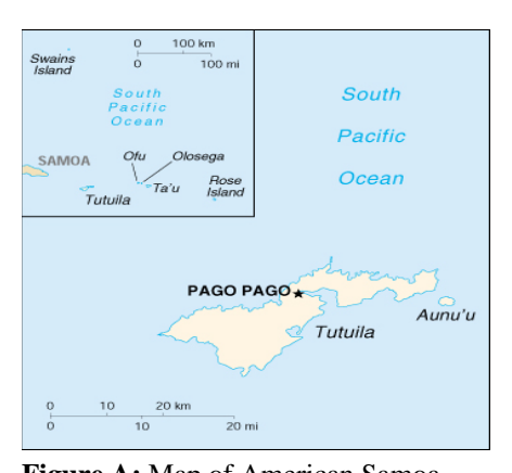
Figure A: Map of American Samoa.

H.R. 6062 (Rep. Radewagen), To restore the ability of the people of American Samoa to approve amendments to the territorial constitution based on majority rule in a democratic act of self-determination, as authorized pursuant to an Act of Congress delegating administration of Federal territorial law in the territory to the President, and to the Secretary of the Interior under Executive Order 10264, dated June 29, 1951, under which the Constitution of American Samoa was approved and may be amended without requirement for further congressional action, subject to the authority of Congress under the Territorial Clause in article IV, section 3, clause 2 of the United States Constitution.