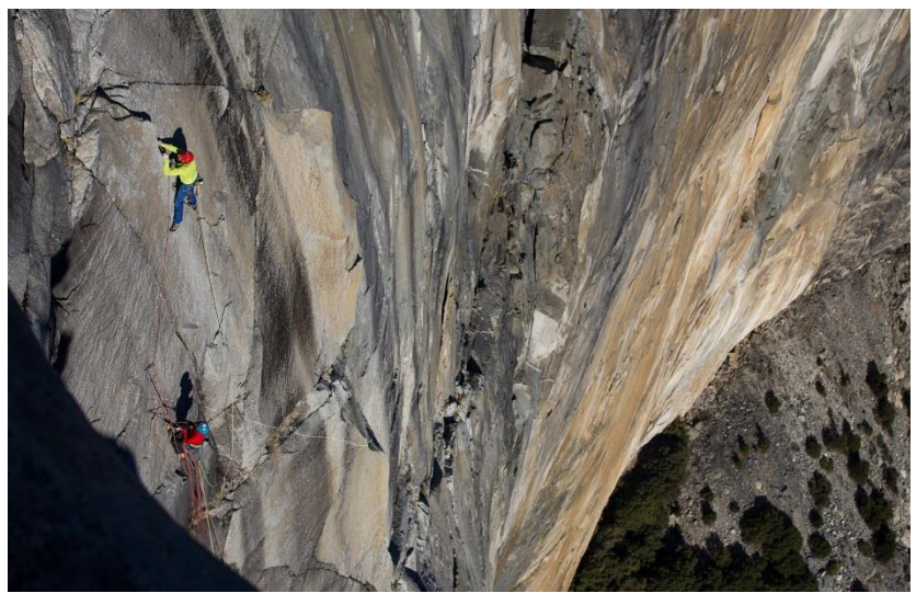
Rock climbing on El Capitan, Yosemite National Park.

There are over eight million climbers in the U.S.<sup>14</sup> In 2017. climbing contributed $12.45 billion to the economy.<sup>15</sup> Climbing is an incredibly important recreational activity on public lands, with federal land management agencies managing approximately 60 percent of the nation's climbing areas encompassing "20,000 discrete cliffs, boulders and alpine objectives inside and outside of designated wilderness."16 Some of the most iconic