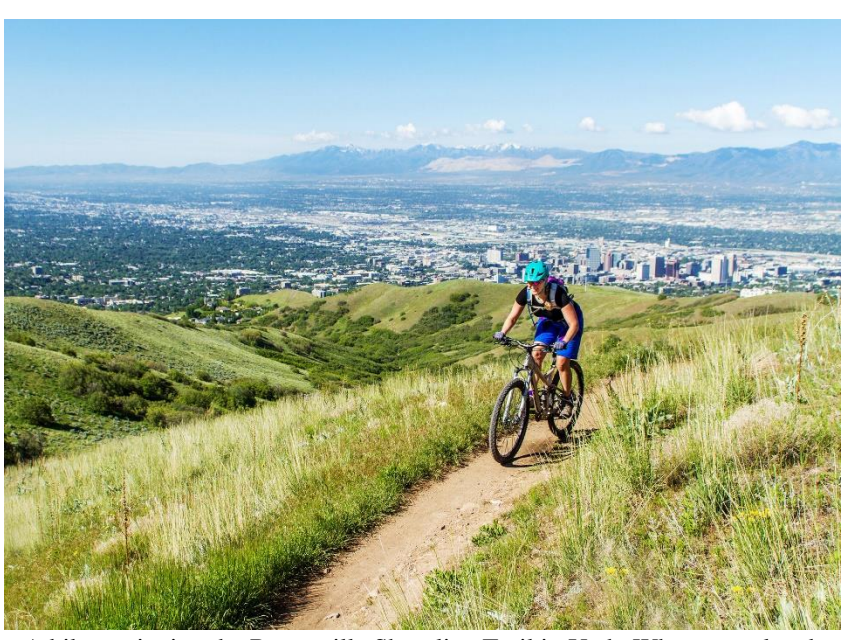
A biker enjoying the Bonneville Shoreline Trail in Utah. When completed, the route will stretch 280 miles.

Biking is one of the fastest growing sectors in the outdoor recreation economy. Specifically, the mountain biking market was valued at $7.9 billion in 2021, with expectations of growing to $16.9 billion by 2030, or by 10 percent annually. 11 From April 2019 to April 2020, nationwide sales of mountain bikes rose by 150 percent.<sup>12</sup> Biking has become so popular that retailers like REI saw demand triple in a single year before a bike shortage in 2021 due to supply chain issues.<sup>13</sup> With this huge increase in mountain bike