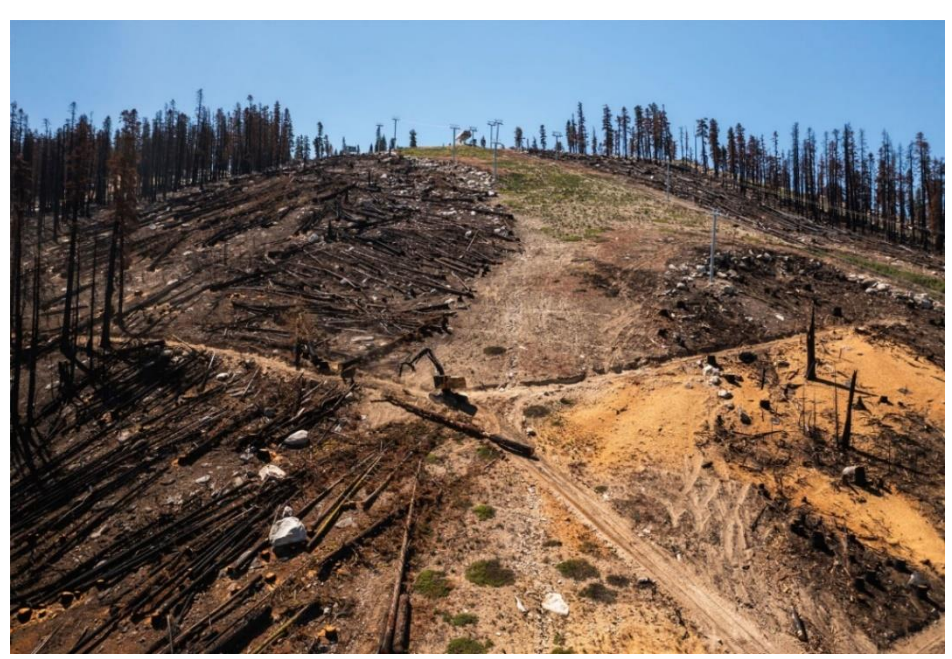
Sierra-at-Tahoe Ski Resort after the Caldor Fire.

The growth of fourseason visitation at ski areas is spurring demand for expanded and updated facilities and amenities from recreational users. Unfortunately, the FS struggles to keep pace with permitting for needed infrastructure improvements and capital investments at existing resorts. Most capital expenditures require years of complex and