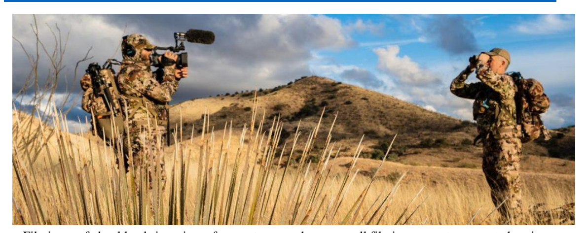
Filming on federal lands is an issue for sportsmen, who use small filming crews to promote hunting on federal lands.

In 2000, Congress passed Public Law 106-206, which standardized the collection of commercial film fees by agencies within DOI and USDA. The law directed the Secretaries of the Interior and of Agriculture to require a permit and establish a reasonable fee for commercial filming activities or similar projects on federal lands.<sup>27</sup> The Committee report for the law expressed its intent was