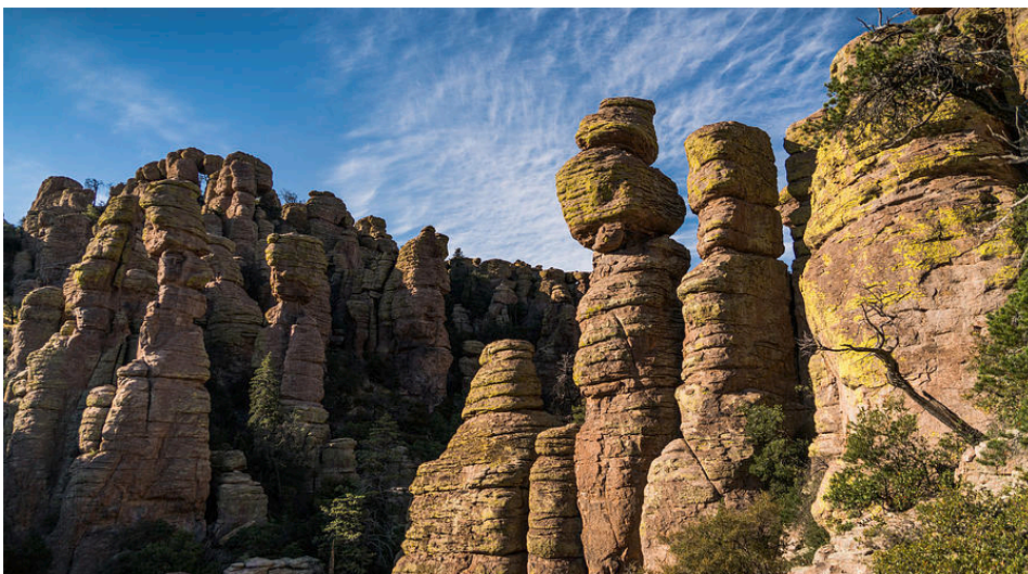
Hoodoos in the Chiricahua National Monument.

In 1924, President Calvin Coolidge established Chiricahua National Monument, located in the Chiricahua Mountains in southeastern Arizona. 1 The area, which the Apache called “The Land of Standing-Up Rocks,” is known for its ancient volcanic hoodoos, pinnacles, and other rock formations. 2 The National Park Service (NPS) administers this 12,000-acre monument, of which over 85 percent is designated as wilderness. 3 Chiricahua National Monument contains evidence of diverse human history spanning thousands of years, including that of prehistoric indigenous peoples, Chiricahua Apache, Buffalo Soldiers, and European American pioneers and ranchers. 4 The national monument contains the Faraway Ranch, which was home to Swedish immigrants in the 19 th century. 5 Chiricahua is also a popular hiking and camping destination, offering several scenic hiking trails that showcase unique rock formations and forested areas with a variety of desert foliage including prickly pear, yuccas, agave, and hedgehog cactus. 6