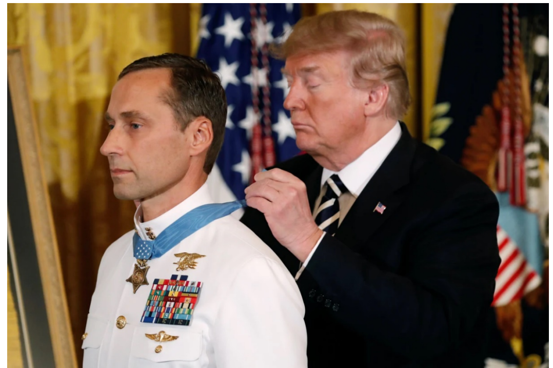
President Trump awarding the Medal of Honor to Master Chief Special Warfare Operator (SEAL), Britt Slabinski, USN, (Ret.)

work, and required that sufficient funds be provided to NPS for maintenance of the commemorative work.<sup>27</sup> Similar to the women's suffrage monument discussed previously, proponents of the Medal of Honor National Memorial are now looking to place the Memorial in a prominent location in the Reserve, requiring a new Act of Congress.