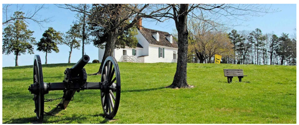
Sailor's Creek Battlefield Historical State Park in Virginia, one of the sites that would be eligible for protection under H.R. 3448.

battlefield sites, Congress created the American Battlefield Protection Program (ABPP) in 1996.<sup>30</sup> The ABPP provides grants in four categories (battlefield land acquisition, battlefield interpretation, battlefield restoration, and preservation planning) to protect sites related to the Revolutionary War, War of 1812, and the Civil War. Since its conception, the ABPP has helped protect more than 100 battlefields in 42 states and protect battlefield lands at 110 battlefield sites in 19 states.