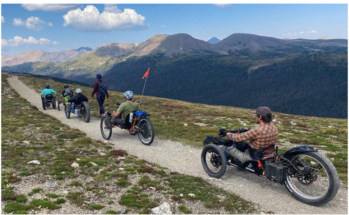
An example of an adaptive trail in Rocky Mountain National Park, Colorado.

place on public lands, although these events are usually planned on an ad-hoc basis. Despite the importance of our public lands to veterans and military service members, federal land managers often lack a cohesive national strategy that prioritizes outdoor programs for veterans. According to one study, "even as public land agencies begin to appreciate ways they can shape therapeutic landscapes, it will require a degree of intentionality to support [outdoor programs for veterans (OPVs)] and promote opportunities for people to gather, seek therapeutic experiences, or heal