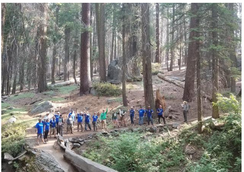
A group of veterans in Sequoia & Kings Canyon National Parks. The group hiked, camped, and completed trail restoration work.

While we can never fully repay our veterans for their sacrifice and service to this country, we can continue to find ways to honor their bravery and improve their transition back to civilian life. Estimates suggest that 50 percent of post-9/11 veterans experience some combination of combatrelated emotional, psychological or physical injuries and as many as 66 percent have diagnosable mental health issues. 1 In addition to physical wounds suffered, many veterans returning home from the battlefield are burdened by mental health issues. Post-traumatic stress disorder (PTSD) occurs in roughly