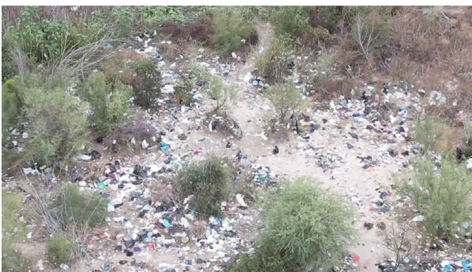
Trash along the border in Texas.

There are devastating environmental consequences of illegal immigration. Illegal immigrants leave behind trash, including human waste, medical products, abandoned vehicles, and plastic. Illegal dumping of trash along the border threatens wildlife, destroys habitat, and attracts disease carrying insects such as mosquitoes and flies. Human waste is a