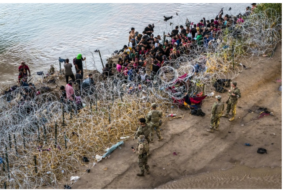
Migrants attempting to cross the border illegally in Eagle Pass, Texas on September 27, 2023.

The Biden administration's ongoing failure to secure our nation's southern border has created a confluence of security. environmental, and humanitarian crises as record numbers of migrants cross illegally into the country. Since President Biden took office, more than 6 million illegal immigrants crossed the southern border into the United States.<sup>1</sup> According to the U.S.