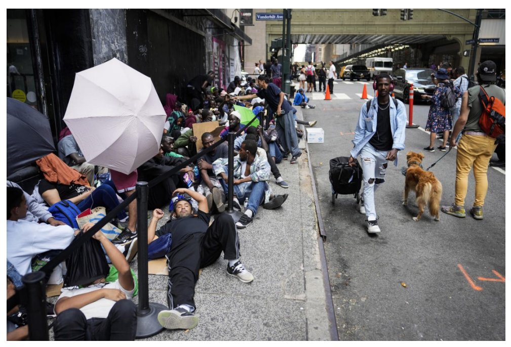
Migrants pictured outside the Roosevelt Hotel in NYC, the city's primary intake center for homeless migrants.

Finalized on September 15, 2023, against strong public outcry from the local community, the lease signed by the Biden administration proposes to house at least 2,000 migrants at Floyd Bennet Field in the NRA.<sup>36</sup> In doing so, the Committee believes the Biden administration violated several laws including NEPA, the