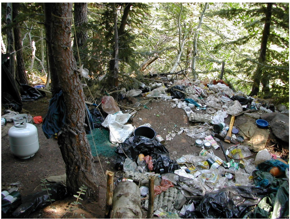
An illegal marijuana cultivation site in the Shasta-Trinity National Forest.

The issue of trash accumulation as a result of illegal immigration is not limited solely to borderlands. USFS reported that 5,801 illegal cannabis cultivation sites were detected on National Forest System lands over the 2011-2022 period.<sup>26</sup> While data is limited, USFS estimated that they have removed 381,510 pounds of trash, 479 miles of plastic irrigation lines, and 228 containers of banned and illegal