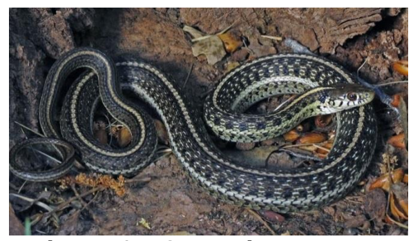
Northern Mexican Gartersnake

On July 8, 2014 the FWS finalized a rule to list two species of gartersnakes found in New Mexico and Arizona, the northern Mexican gartersnake and the narrow-headed gartersnake. Prior to the release of the proposed rule, the FWS issued a peer review plan for these species in which it stated it would seek peer reviewers with expertise in the species' ecologies, who were independent from the FWS, were "recognized by their peers as being