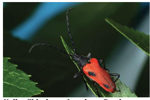
Valley Elderberry Longhorn Beetle

Unlike other peer reviews, the FWS posted a peer review plan for the delisting of the VELB after the peer review process had already been completed. For the peer review of the delisting decision, the FWS sought peer review proposals from one of the pre-approved contractors and selected Atkins as the firm that would conduct the peer review of the proposed delisting rule. 193