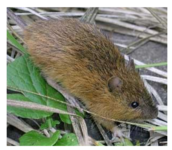
New Mexico Jumping Mouse

Prior to issuing the final listing decision, FWS solicited peer reviews from four individuals. According to the peer review plan, the peer reviewers were selected based on their relevant expertise (i.e., jumping mouse ecology), independence from the FWS, objectivity, affiliation with an advocacy position, and absence of conflicts of interest. Out of the four individuals