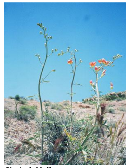
Gierisch Mallow

On August 13, 2013, the FWS finalized an endangered listing for the mallow. The FWS remarked in the final rule designating critical habitat for the mallow