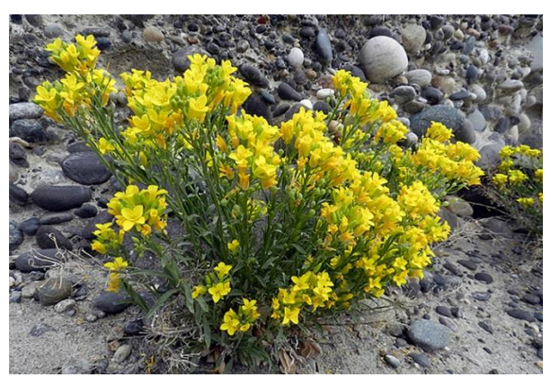
White Bluffs Bladderpod

The FWS solicited five peer reviewers, four of whom agreed to provide comments and who are identified on the FWS Region 1's website as part of the peer review plan for the bladderpod.<sup>79</sup> Although the FWS identified who the peer reviewers were, the copies of the comments the reviewers made were not publicly available on Regulations.gov. Rather, the FWS provides a link to a summary of the peer reviewers' comments and the FWS' responses.<sup>80</sup>