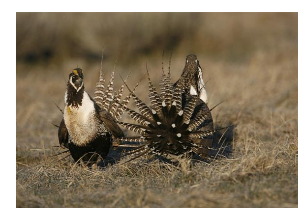
Gunnison Sage-Grouse

plan for the listing of the sage-grouse.<sup>177</sup> To identify and nominate peer reviewers, the FWS, "in cooperation with Colorado Parks and Wildlife and the Utah Division of Wildlife Resources," sought at least "three qualified experts" who exhibited the following four criteria: (1) expertise with the Gunnison sagegrouse or similar species biology; (2) independence from the FWS; (3) "recognition by his or her peers as being objective, openminded, and thoughtful" and; (4) absence of any financial or other interest that would create a conflict of interest, an impairment of objectivity, or an unfair competitive