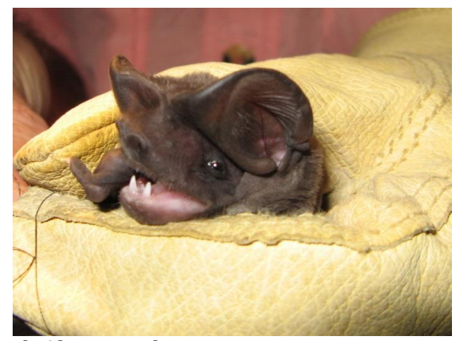
Florida Bonneted Bat

In accordance with the plan, the FWS stated in the final rule that it had solicited "10 individuals with recognized expertise on bats, particularly molossids, as well as general expertise on bat ecology and conservation" to be peer reviewers of whom six responded. Although the FWS does not identify who the peer review participants were on the Regional website or in the final rule, the Committee Majority