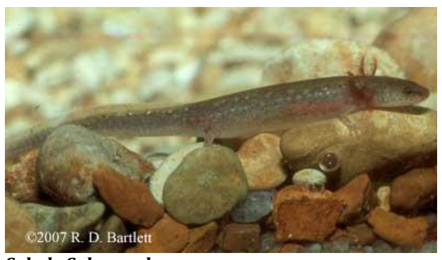
Salado Salamander

On February 24, 2014, the FWS listed the Georgetown salamander and the Salado salamander as threatened. These four salamander species had been identified as candidate species in 2001 and 2002. On May 11, 2004, the Center for Biological