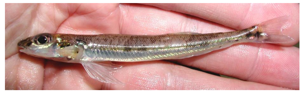
Diamond Darter

The FWS made a determination of endangered species status for the diamond darter on July 26, 2013.^{167} The diamond darter is a fish species found in West Virginia and had been under consideration for listing since 2009.^{168}