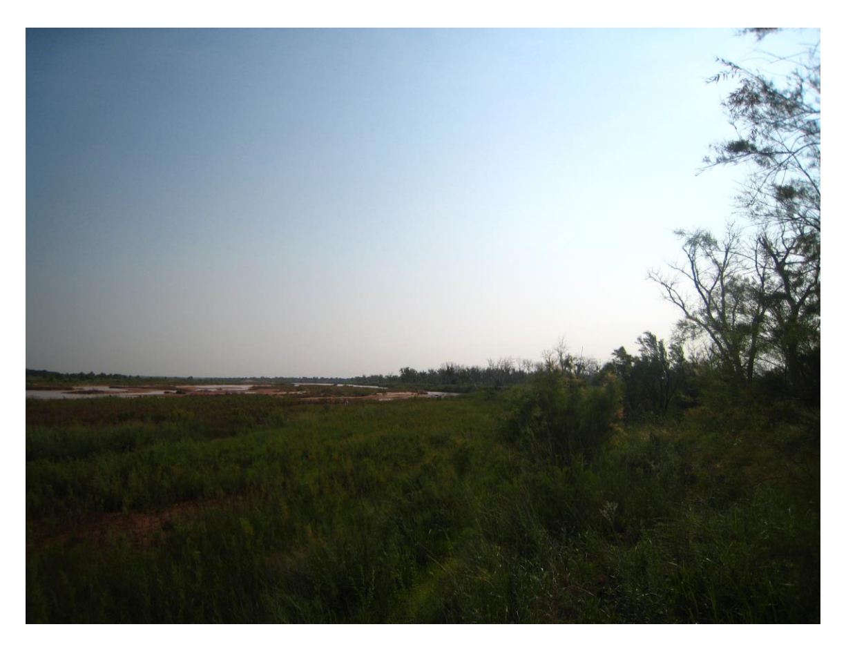
Red River Bed. Picture taken from top of Cut Bank.