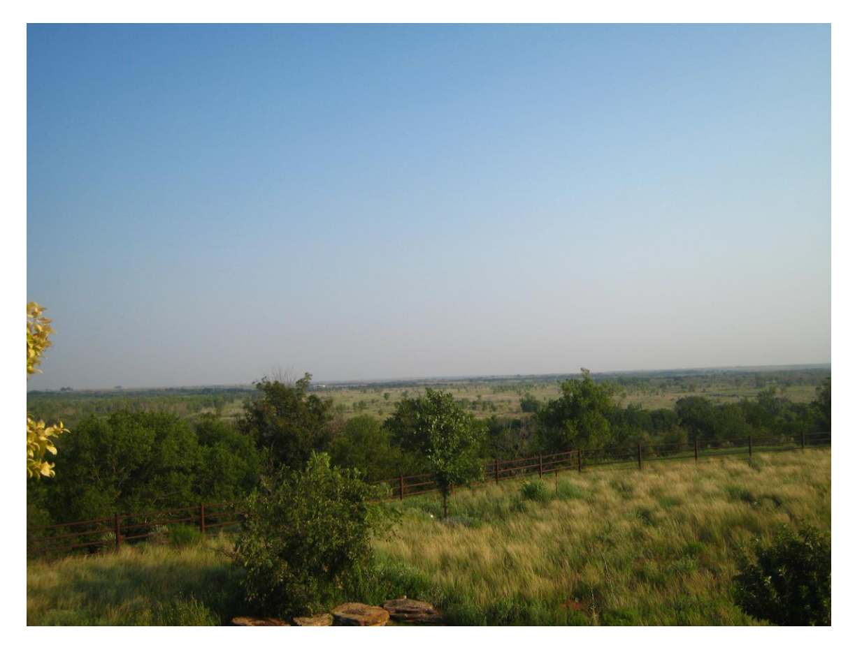
River Bottom View from top of High Bluff