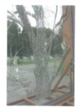
Photo 3: Overall view of tapeatry prior to wenthinun debris betting