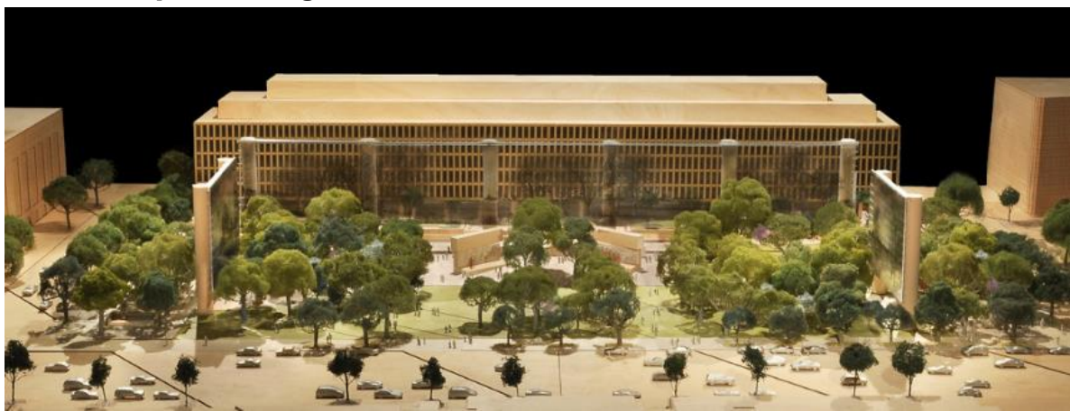
Source: Eisenhower Memorial Design Booklet, Submitted by Gehry Partners to NCPC on February 28, 2014, at 6.

On March 4, 2014, the Commission submitted its fiscal year 2015 budget justification to Congress, seeking $19.3 million for construction of the Memorial and an additional $2 million for Commission expenses. After taking several months in an attempt to assuage the NCPC's September 2013 concerns, the Commission submitted to the NCPC a modified design with the hope of obtaining approval of the site and building plans.