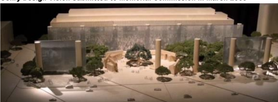
Gehry Design Vision Submitted to Memorial Commission in March 2009

The "main idea" presented in the video "was to make a translucent screen – like a tapestry – made out of metal so that it required no maintenance. " This tapestry would be composed of "metal fibers that would depict the highlights of Eisenhower's career."