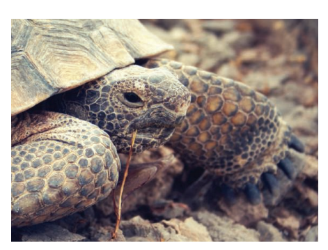
The Desert Tortoise ( Gopherus agassizii ). The Mojave Desert population of the Desert Tortoise was petitioned to be listed, but was originally not listed by FWS. The species was listed by FWS after subsequent litigation.

Although controversy surrounding citizen involvement in ESA listing is longstanding, there has not been an objective analysis comparing species listed by FWS of its own accord to those listed after petition or lawsuit by citizen actors (1). Biological threat provides a test for citizen involvement: If petitioned and litigated species are less biologically threatened, on average, than species selected by FWS, that would provide an argument for reducing citizen involvement in the ESA. Such an argument would be strengthened if citizen groups disproportionately focus on species whose selection might have been based on reasons other than threat, i.e., species that are in conflict with development